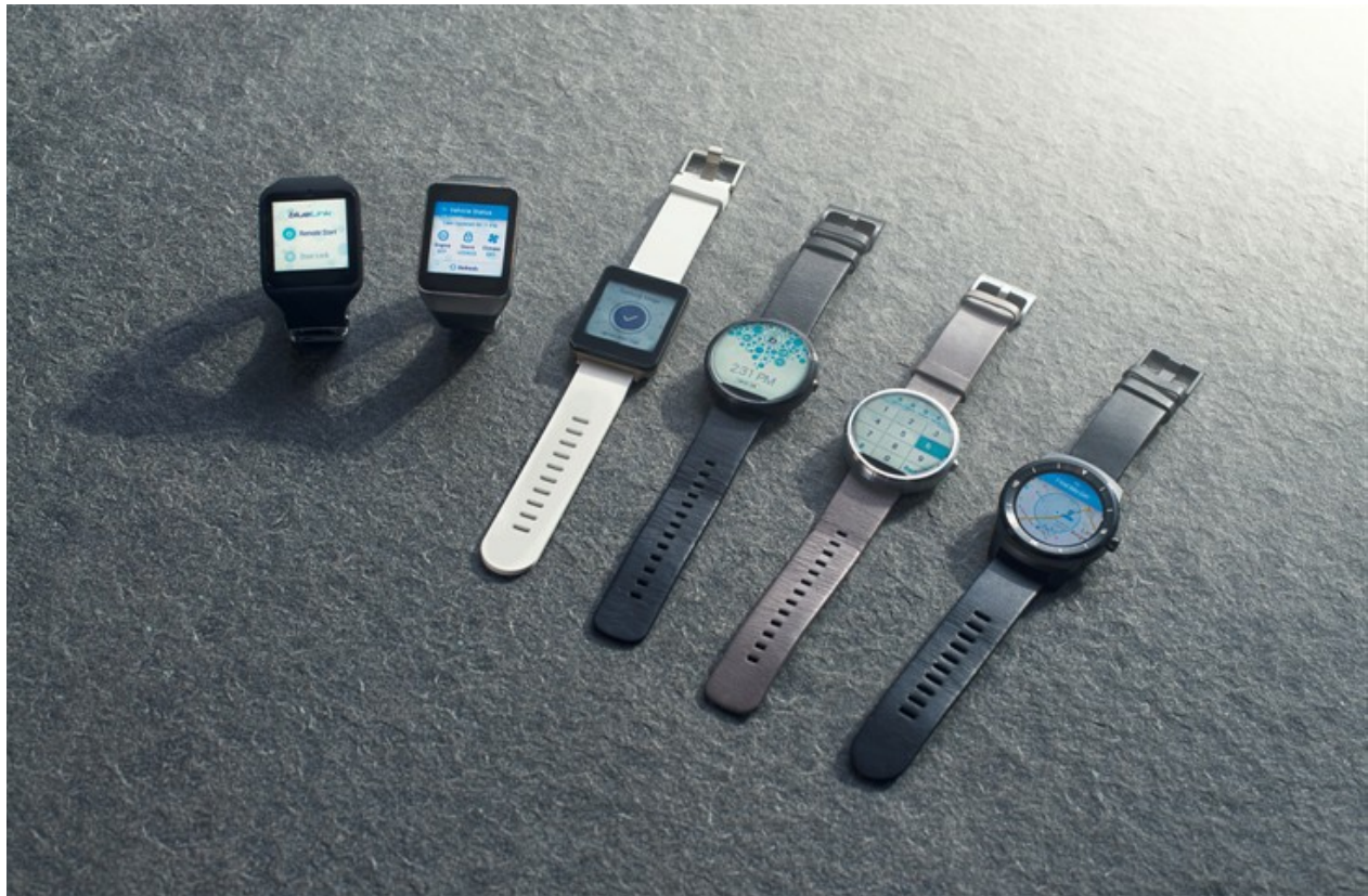
The Hyundai Blue Link Smartwatch app on wearables from Motorola, LG, Samsung and Sony

The Blue Link smartwatch app must be paired via Bluetooth to an owner's smartphone that contains the Blue Link mobile app. Remote functions can then be executed from almost anywhere in the U.S. as long as the user's smartphone has a Bluetooth and cellular or Internet connection.