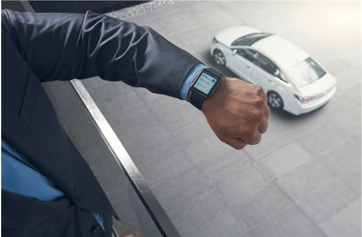
The Hyundai Blue Link Smartwatch app on Apple Watch