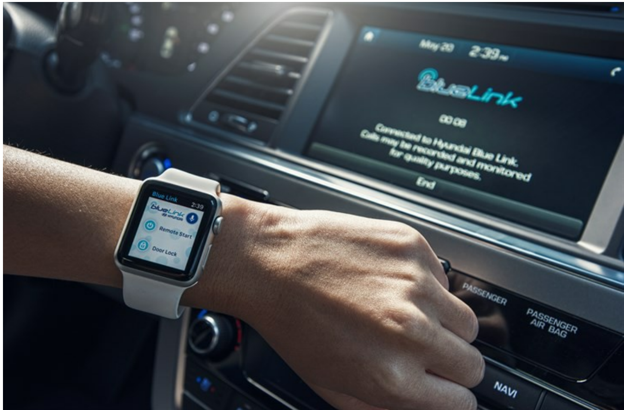
The Hyundai Blue Link Smartwatch app on Apple Watch

The Blue Link Apple Watch app works with first and next generation Blue Link equipped Hyundai models. The first generation Blue Link system rolled out on the 2012 Sonata and expanded across the lineup through 2013. Next generation Blue Link equipped models include the 2015 Genesis, Sonata and Azera. The Apple Watch app provides all Blue Link users, including first generation owners, with even more freedom of choice when interacting with their Hyundai.