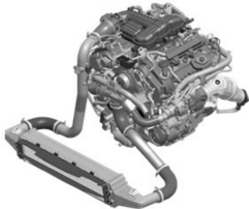
G90 3.3-liter twin-turbocharged V6 engine

G90 is fitted with a choice of two gasoline engines: a 3.3-liter direct-injected, twin-turbocharged V6 engine developing an estimated 365 horsepower @ 6,000 rpm (with optional premium fuel), or the top-trim 5.0-liter direct-injected V8 engine developing an estimated 420 horsepower @ 6,000 rpm (with optional premium fuel). With either powertrain, G90 boasts impressive performance characteristics even while offering exceptional passenger comfort, a hallmark of the Genesis brand.